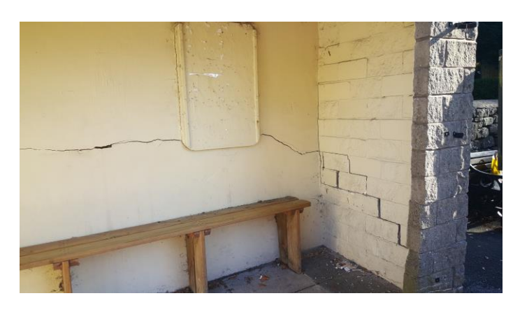
Structural Damage to the Shelter