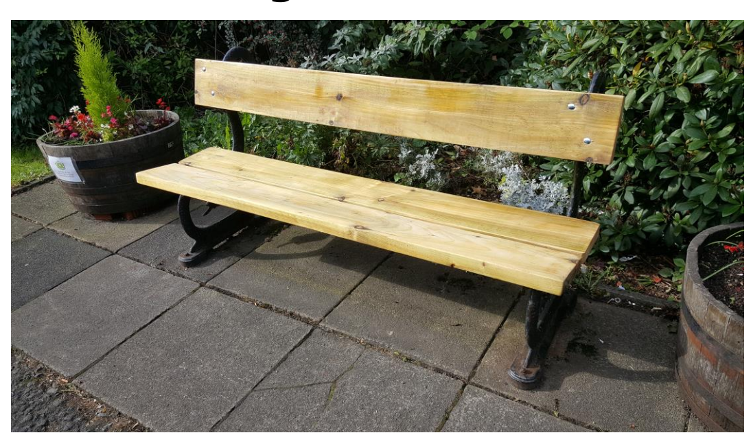
Refurbished Bench at Broadway

After Pendle Borough Council's transfer of responsibility for roadside benches to the Parish Council, an assessment was carried out. Most benches were identified as needing either major refurbishment or minor repairs.