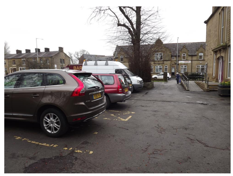
10.30am Wednesday 22<sup>nd</sup> February, Car Park Full with visitors to the Royal British Legion, No users in Holmefield House

Increased community use at Holmefield House and the Royal British Legion Office have highlighted the inadequacies of the current parking arrangements. The lack of on street parking around the area has led to problems when either two activities are carried out simultaneously or a large activity or function is taking place. The Council considers that the activities at Holmefield House should not adversely impact on local residential parking.