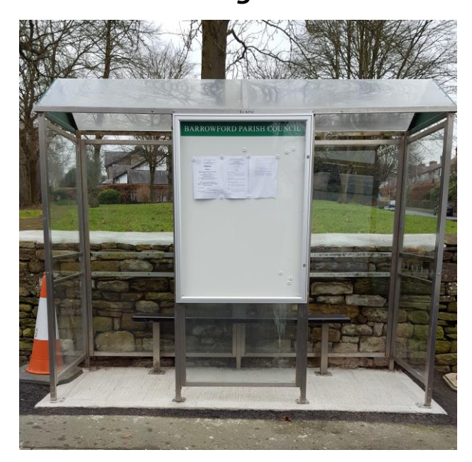
Replacement Shelter Installed

Pendle Borough Council resolved in 2016 to discontinue both new provision of bus shelters and maintenance of existing ones throughout Pendle.