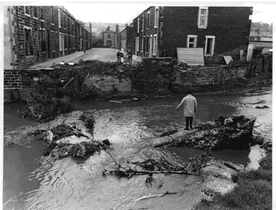
Below: Wilton Street the day after, from Bullholme