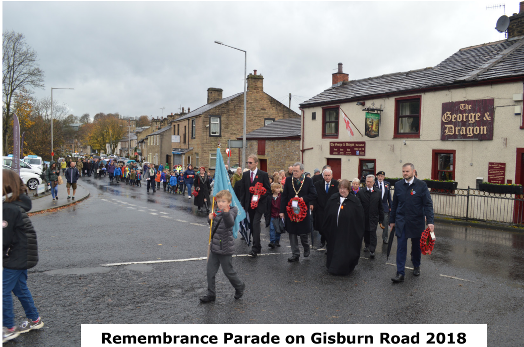
Remembrance Parade on Gisburn Road 2018