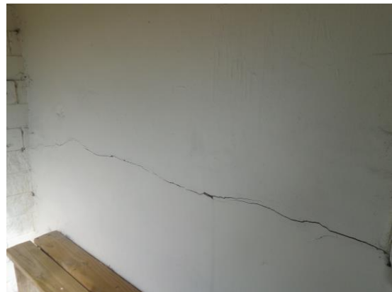
Crack to Rear wall