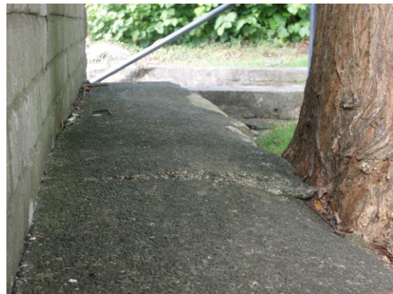
Tree up against Rear Wall

The movement could be stabilised by the removal of the tree but the Borough Engineer could give a more definitive answer.